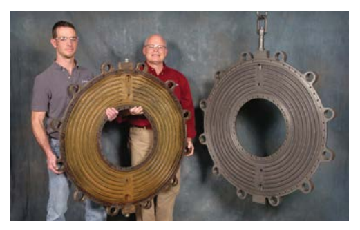
A new 36" composite water jacket (above, left) weighs approx. 95 lbs. A comparable 36" cast iron jacket (above, right) weighs approx. 375 lbs. The reduced weight is a significant maintenance and installation benefit in weight-restricted applications.

The composite material in the new water jackets was developed by Wichita engineers working with a partner firm who tested several polymer combinations before selecting the high-tech blend that satisfied the design requirement to be as strong as the original iron parts' typical design stresses. In fact, structural testing of the AquaMaKKs 36-inch diameter composite water jacket resulted in zero failures even when the part was stressed to more than four times the maximum design load.