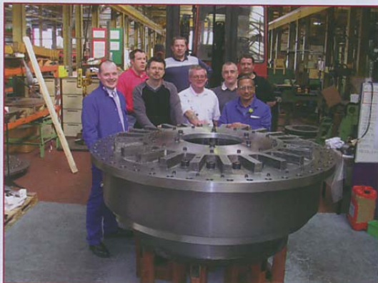
The HBS Assembly Team

Wichita was chosen because of its long and proven track record in the supply of heavy-duty Clutch and Brake solutions to the industrial sector. Another significant factor contributing to our involvement in such a prestigious project is our commitment to design flexibility, an essential prerequisite in this type of specialised application