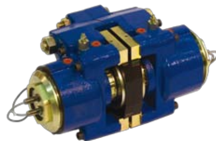
Twiflex VCS Mk.4

Offering the best possible performance in demanding applications, the new VCS Mk.4 from Twiflex is a spring-applied, hydraulically-released caliper brake, employing the same basic technology as Twiflex's well proven VCS Mk.3 caliper brakes, which have demonstrated their reliability and consistent performance over many years service in the most demanding applications worldwide. The VCS Mk.4 has been designed to provide a 50% increase in pad area, providing improved stopping and holding. The design also features increased service factors, modular construction for easy assembly and maintenance, plus precision monitoring options, and improved sealing and full compatibility with existing VCS mounts and controlled braking systems.